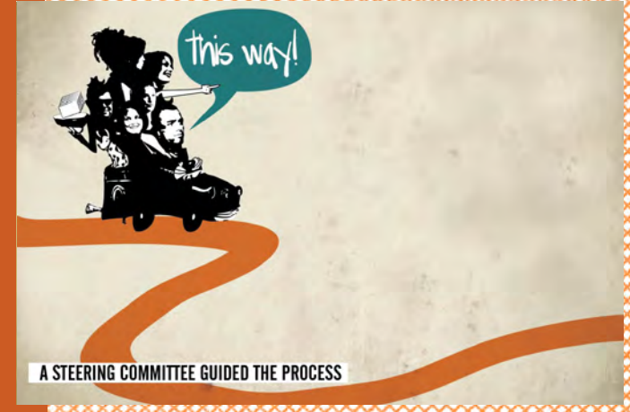
A STEERING COMMITTEE GUIDED THE PROCESS