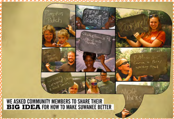
WE ASKED COMMUNITY MEMBERS TO SHARE THEIR BIG IDEA FOR HOW TO MAKE SUWANEES BETTER