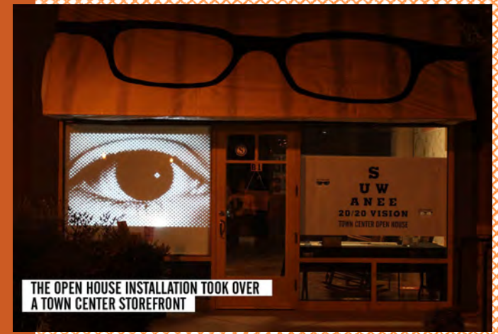
THE OPEN HOUSE INSTALLATION TOOK OVER A TOWN CENTER STOREFRONT