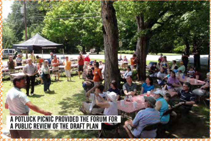
A POTLUCK PICNIC PROVIDED THE FORUM FOR A PUBLIC REVIEW OF THE DRAFT PLAN