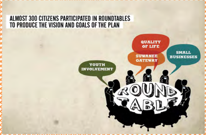
ALMOST 300 CITIZENS PARTICIPATED IN ROUNDTABLES TO PRODUCE THE VISION AND GOALS OF THE PLAN