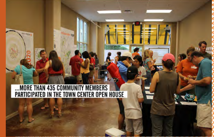
...MORE THAN 435 COMMUNITY MEMBERS PARTICIPATED IN THE TOWN CENTER OPEN HOUSE