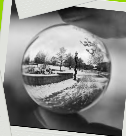
"Winter Sneak Peak" - Autumn Crowley