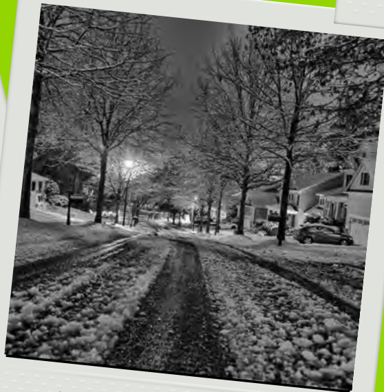
"Grand Park Drive with Snow" - Markus Rimmelle