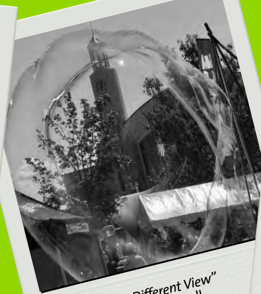
"A Different View" - Eric Rozell