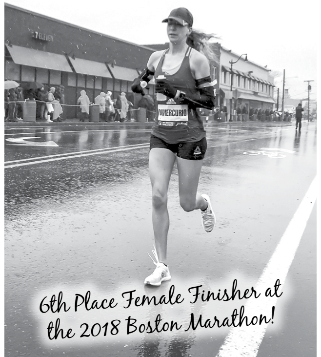
6th Place Female Finisher at the 2018 Boston Marathon!