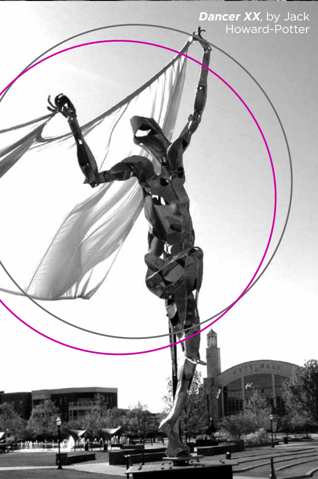
Dancer XX , by Jack Howard-Potter

The City of Suwanee is seeking proposals and samples from artists willing to go out on a limb for the city's finders-keepers art-in-nature program.