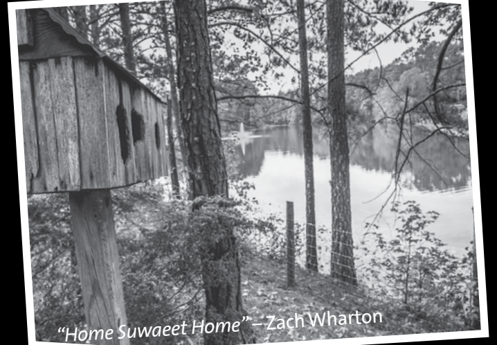
"Home Suwaeet Home" – Zach Wharton