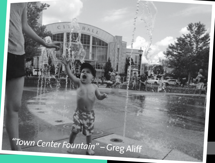
"Town Center Fountain" – Greg Aliff