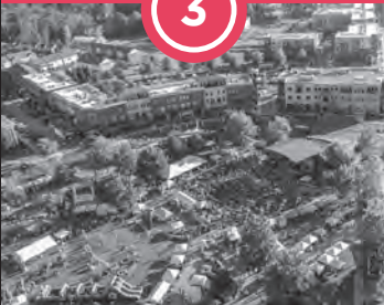
2020 Event Calendar