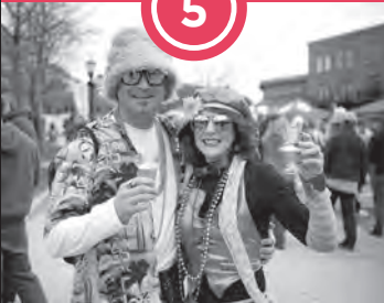
Beer Fest Celebrates 10 Years