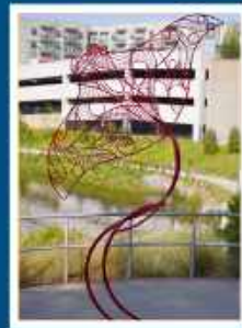
Devil Fish by Todd Kappes Frahm