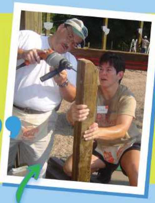
The Mayor, Police Chief, AND Deputy Police Chief all helped build the original PlayTown Suwanee!