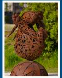
Tangled Hare by Todd Kappes Frahm

Explore underground with this balled up bunny?